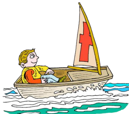
Set sail into the future with Jesus