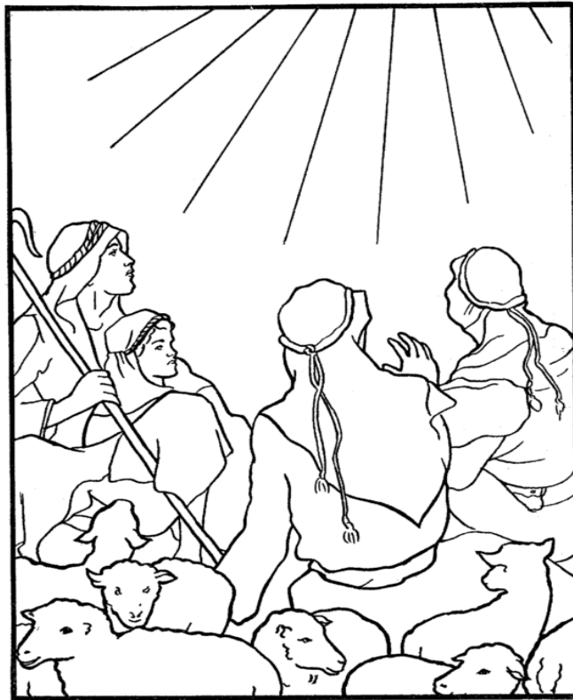
The Shepherds Saw a Great Light

By human thinking, shepherds at that time were not thought to be people you wanted to be around. They were constantly out in the fields with their sheep so they were probably dirty. They were raising the sheep which were to be sacrificed in the temple. However, they couldn't even go into the temple! Yet, they were very faithful in taking care of their sheep day and night! These were the people God chose to be the first to see the Messiah!